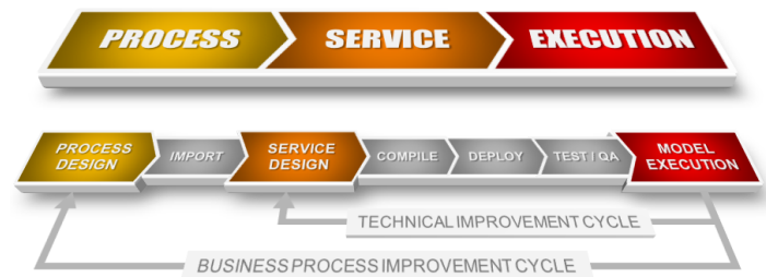
Figure 3: The Model Driven Integration Development Process

One of the key strengths of the Model Driven Integration development process is that it does not rely on any preconditions to fit a given operational context, whether at the architectural or at the organizational level. The end-to-end philosophy naturally favors small, incremental steps. Regardless of the architectural approach – top-down, bottom-up or middle-out – the typical development cycle follows a five-step process from process design and service identification to runtime execution in production. The following paragraphs describe each of the five steps in more detail: